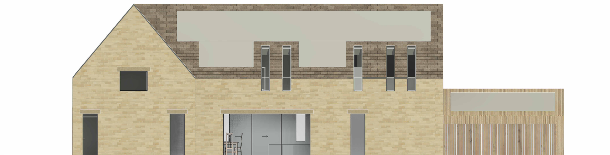
EL - ZZ Rear Elevation 1 : 100