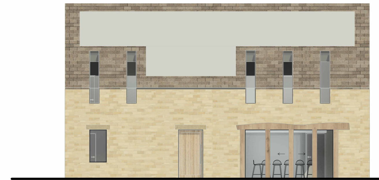
EL - ZZ Side Elevation A 1 : 100