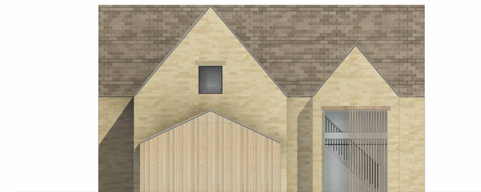
EL - ZZ Side Elevation B 1 : 100